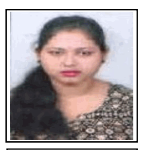
Maus um? Chakorabonty